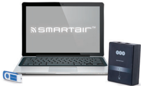
PC, software and card encoder